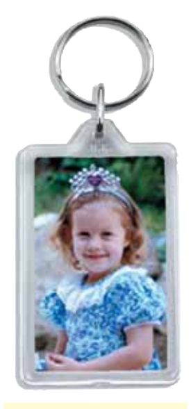
Size 50mm x 35mm