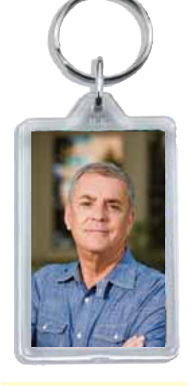
Size 50mm x 35mm