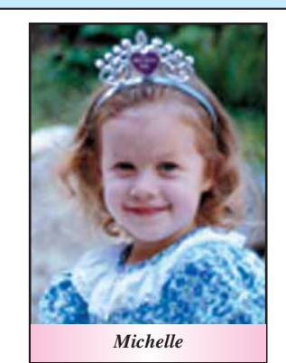
Rectangle + Name